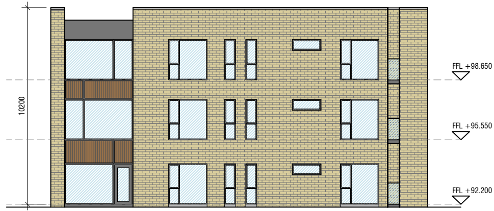
E4 WEST ELEVATION SCALE 1:200