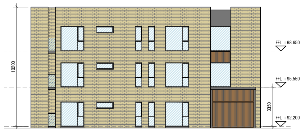
E4 EAST ELEVATION SCALE 1:200