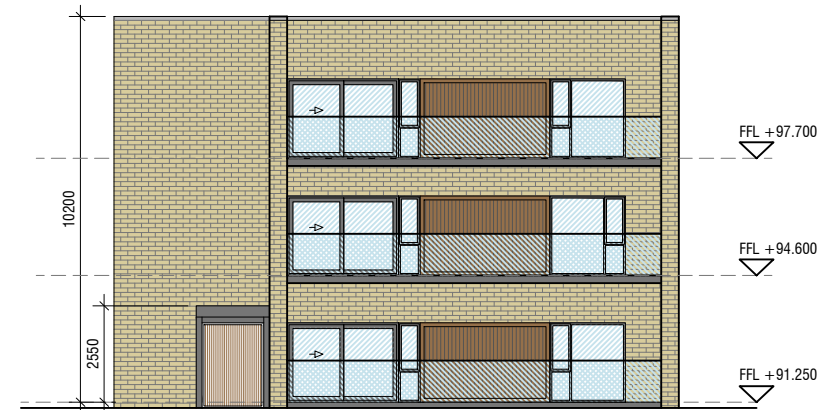
E3 NORTH ELEVATION SCALE 1:200