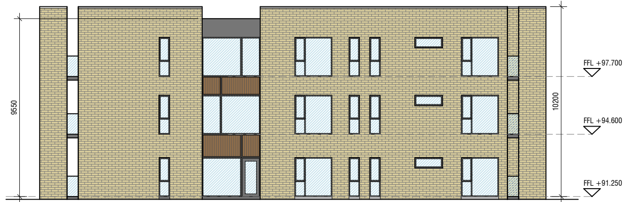
E3 WEST ELEVATION SCALE 1:200