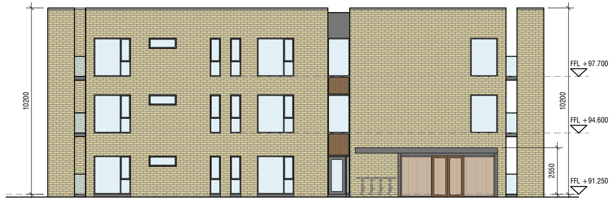
E3 EAST ELEVATION SCALE 1:200