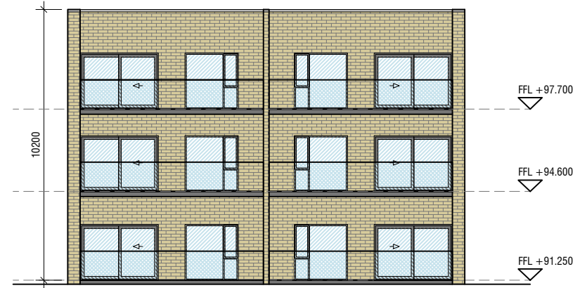
E3 SOUTH ELEVATION SCALE 1:200